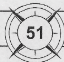
Table for two? Welcome to our Learn with Word Search restaurant. On the menu are the following helpful and delicious restaurant related words. Enjoy!

V H U F M P A D A V É J A S I N N N M P E Y C A E H E S R U O C N I A M Ž E A A Š H N N N Q T S D S T I T K I W W G T È S P A U U A L Š H E K R N I G A R P S Ž D Y Č T S L S Q C P S I E M I I G U A T E C Y F I A F I A G R S E T N A T S F U S B O B E A R N D D E N E D I P W R K A E U E U U I K A S N I R I R P I I Y A L R H U V R Ž S S Š U A N T T T O N Č E E T I P G D N Ū E A A I K N I A E E I R T A Č B L Š E T A W S S L Ž E B E L A B A S S È L È T E V R E S Ū H U R W I I D I O A A R E Z I T E P P A Š E A R S A U T A S T N P N P R E S T R O O M S T L T E W I T Y G L A V A K A R I E N È N E È M